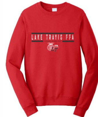
Red Sweatshirt w/ Chapter Shirt Design (front only)