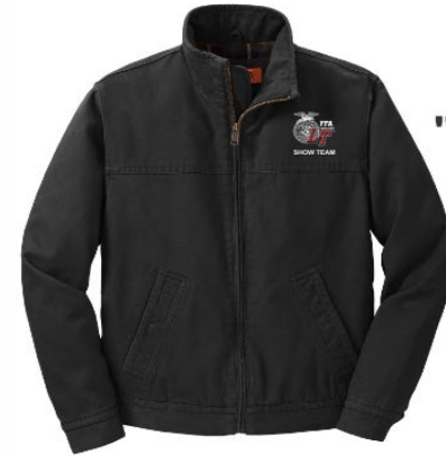
"Show Team" Jacket