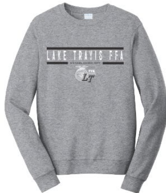
Grey Sweatshirt w/ Chapter Shirt Design (front only)