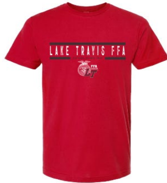
2024-2025 Chapter T-Shirts

Please make sure forms are turned in by 10/1 to ensure you get the size you want.